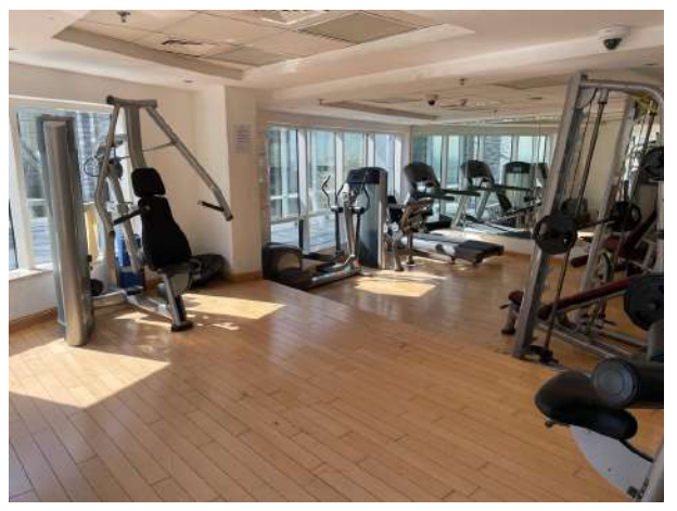
Full access to all the building amenities, including: a lobby and entrance hall, swimming pool with controlled temperature, gym, sauna, steam room and changing rooms.

Supermarket, discount, coffee shops, restaurants, laundry, tailor, money exchange, pharmacy, beauty saloons, banks, offices, ATM machine and Almas tower are available in walking distance near the building.