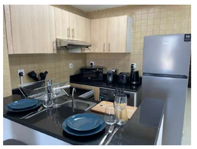
The flat has a fully equipped kitchen (fridge, freezer, microwave, electric kettle, toaster, all cutlery and crockery, dishes, pans, bowls, etc.), a mid size guest toilet is in located in the corridor; ironing board, iron and vacuum available and a fully equipped balcony.

The studio has a build in 2 doors wardrobe storage.